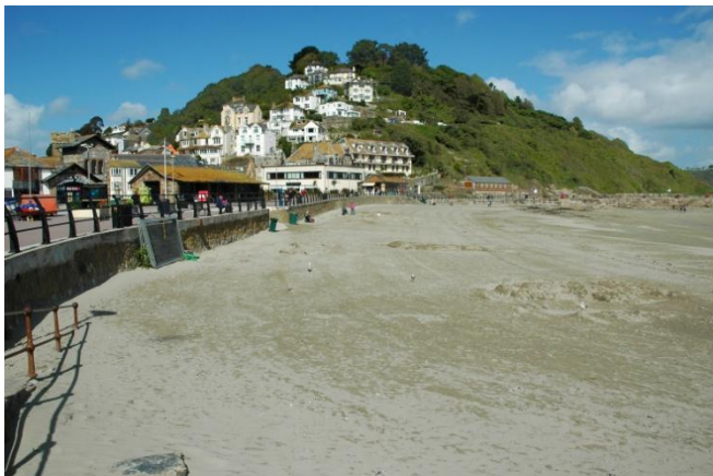
A wonderful beach from Banjo Pier looking towards Mount Ararat

Looe is the major tourist centre along the south-east coast of Cornwall and is divided into West Looe and East Looe by the Looe River. The Town has an important fishing tradition and today has an important fishing fleet which is based alongside the quay at East Looe adjacent to the fish market. The centre of East Looe is made up of narrow streets which have lots charm and contains the majority of the shops, cafes, restaurants and pubs. Looe in Cornish is ‘Logh’ meaning deep water inlet and is