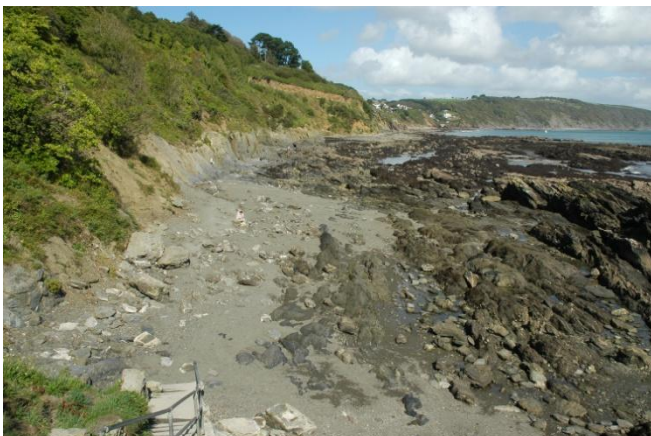
The easterly beach looking towards Plaidy

There is safety equipment on the seafront but