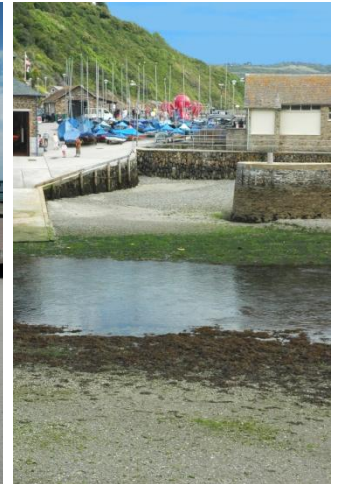
The River, beach and Sailing Club

the way to West Looe. From the north and Liskeard and the A38 follow the B3254 or the B3252 to East Looe and from the Plymouth, Torpoint and the east the A374. There is little or no parking in the Town Centre or anywhere close to the beach. The Millpool car park (capacity over 900cars) at West Looe is the best option although it is over 700m from the beach. There are two smaller car parks in East Looe either side of the bridge over the river (capacity 80 and 150 cars) but in the summer they can be full early in the day. An alternative way of getting to Looe is using the train from Liskeard; it is a scenic ride down the valley and thoroughly recommended. The station is about 800m from the beach.