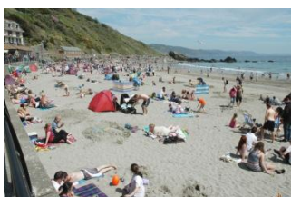
Looking towards Pen Rocks

PL13 1HA – From the west and St.Austell take the A390 to Middle Taphouse and then the B3359 all