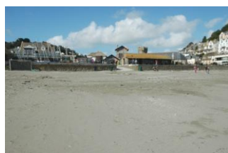
Looking towards the seafront