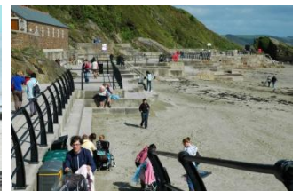
The Seafront and Beach

and all the hustle and bustle. There are two slipway access points to the beach which makes it suitable for pushchairs and wheelchairs plus a variety of other steps. There is also a path from East Cliff Road down to the seafront. To get to the beach beyond Pen Rocks continue to the far end of the seafront and down steps to the beach. This length of beach is over 700m long to Chough Rocks and Plaidy Beach and there is a public footpath down the cliffs from the Coast Path and Bay View Drive (a residential area of East Looe) some 500m from the main beach.