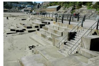
Easterly part of the seafront

Dogs are not permitted at any time on the main beach but there are no restrictions on the easterly beach.