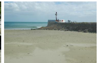
The distinctive Banjo Pier