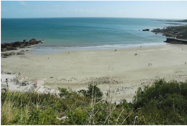
View of the beach at low water from East Cliff