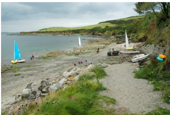
Parbean Cove and slipway access from the Coast Path

A series of small coves and beaches either side of Nare Point on the southern side of the mouth of the Helford Estuary. About 800m east of Gillan Cove, Men Aver Beach is beneath Lestowder Cliff and runs into Parbean Cove which has two areas of shingle beach and is the most accessible and most used. Polnare Cove is the seaward side of Nare Point.