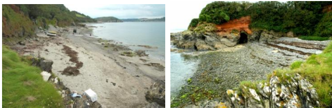
Parbean with Men Aver beyond Easterly end of Parbean Cove

TR12 6ES - From Helston on the A3083, take the B3293 at the end of Culdrose Naval Base. Pass through Garras and after 2kms turn left to Newtown in St.Martin. Turn right and immediately left to Manaccan; continue through Manaccan on road signposted Gillan and St.Keverne for 2.8kms and at the cross roads follow the no-through road to Lestowder and Penare. Park on the roadside at Lestowder Farm (but do not obstruct the road or farm gateways) and walk down hill and across the stream and on the left is a stile to public access land; cross the field to the Coast Path then turn left across the bridge over the stream to the slipway to Parbean Cove and Men Aver Beach. Do not use the other private slipway. To get to Polnare Cove walk along the Coast Path to the Coast Watch lookout at Nare Point and there are steps next to the lookout on to the beach.