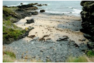
Polnare Cove at low water