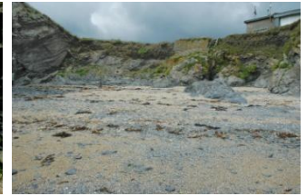
Lookout and steps at Polnare